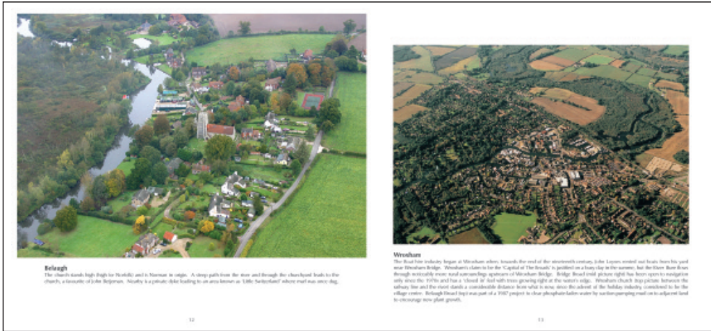
Example of a double page spread.