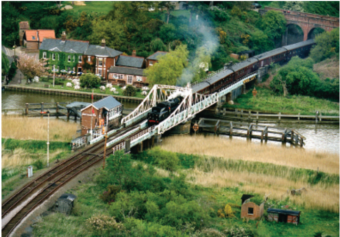
Crossing Reedham Railway Bridge