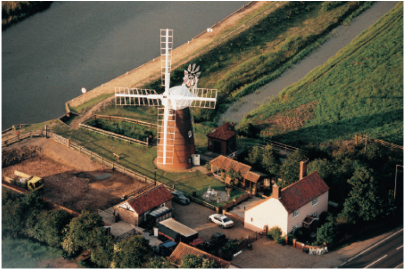
Stracey Arms Mill