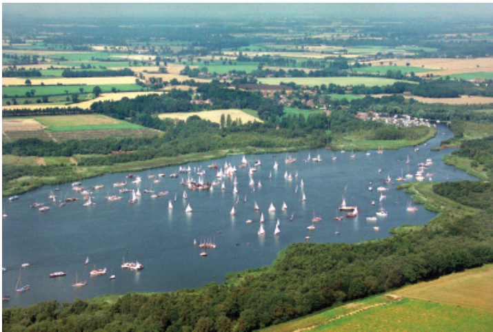
Above: Barton Regatta